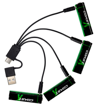
Multi-charge cable supplied